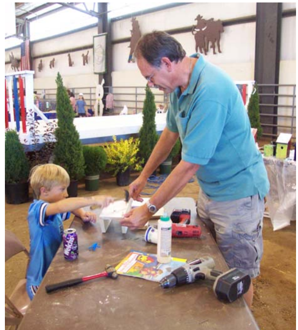
Kids enjoyed assembling birdhouses with Guild members at the August 6th Jefferson County 4-H Fair.