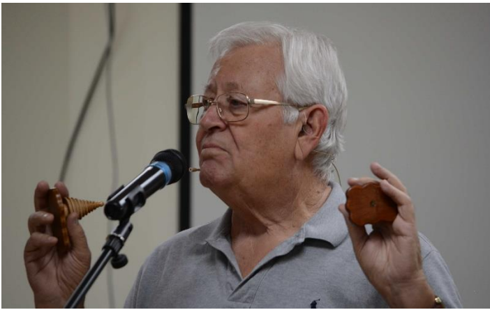
He turned two small trees made of Maple finished in Tung Oil.