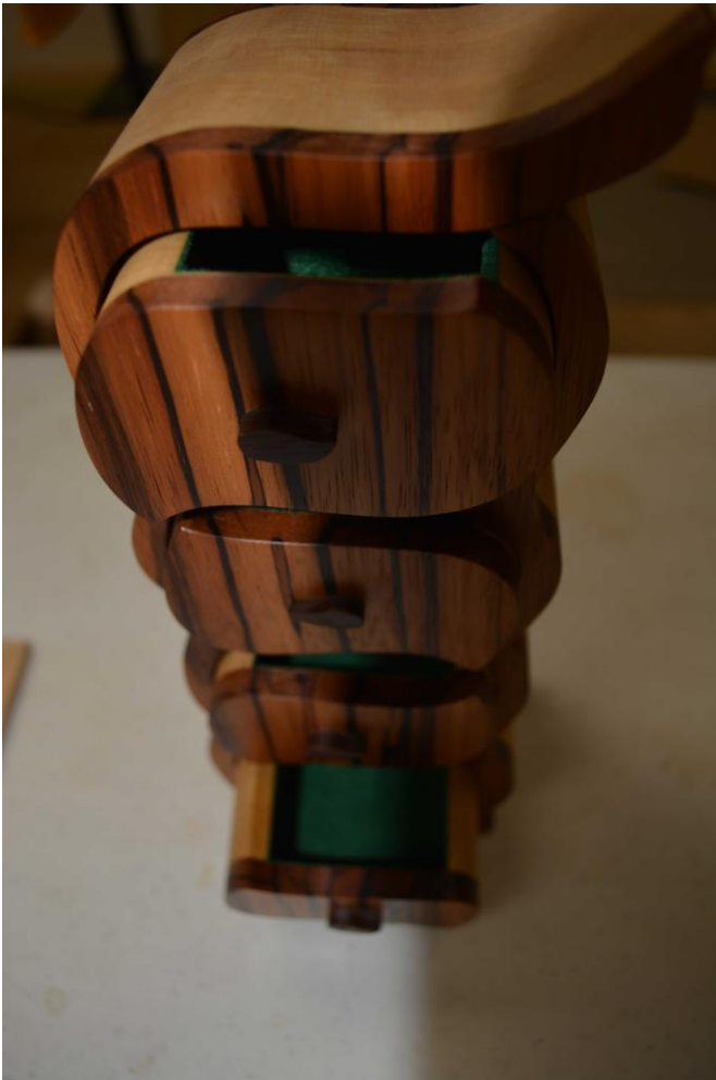
Figure 3: Cristina's Bandsaw Box