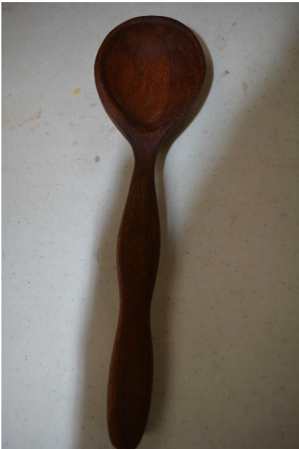
Figure 8: The Finished Ladle