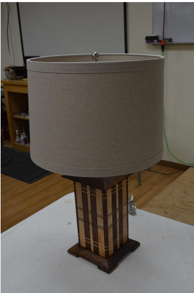
Figure 2: Livingston Taran Lamp