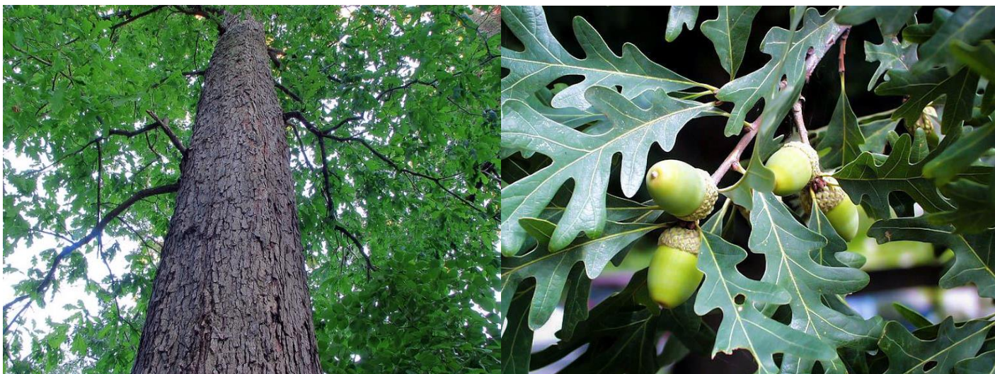
Tree Trunk & Branches