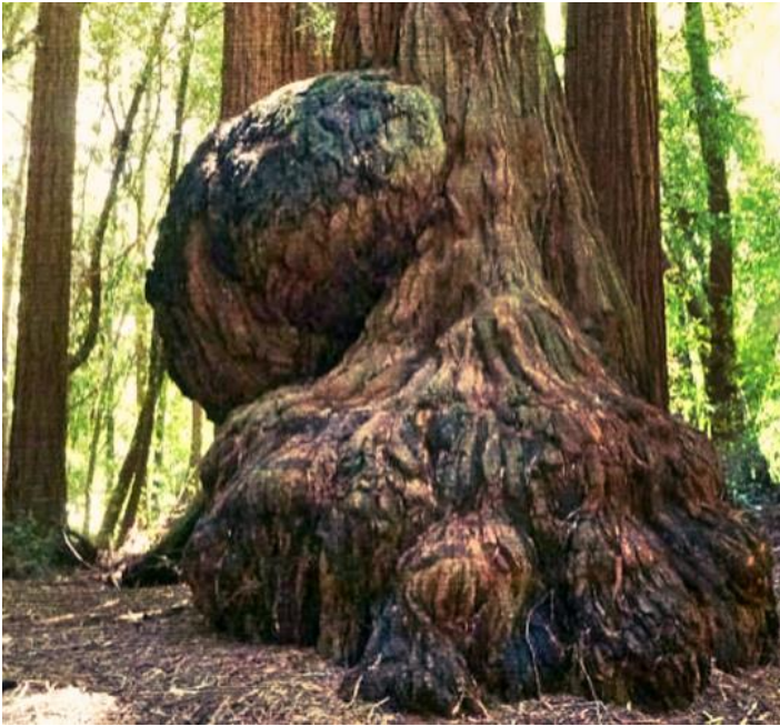
Tree with Buttressing and Burl