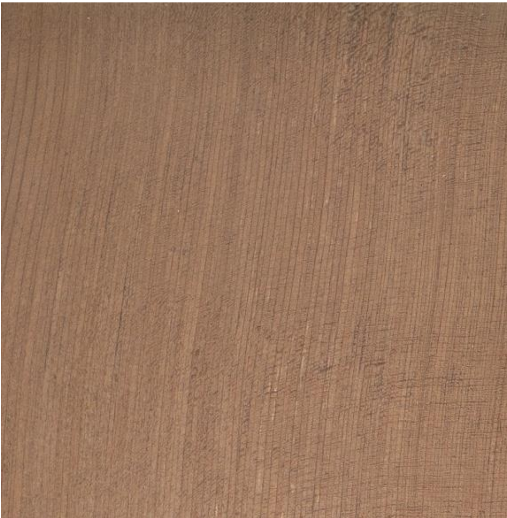
Sanded Redwood Board