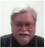
Stan Pitts' "Bread Box W/ Cutting Board"