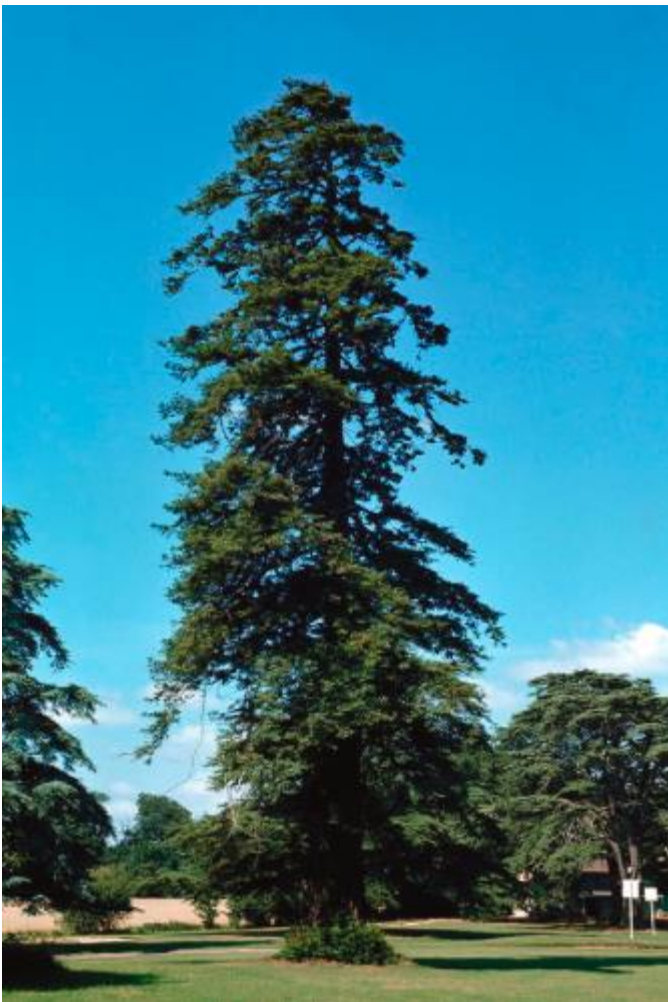
Tall Standing Tree in a Park

This month we consider Redwood . The most common redwood is the Coast Redwood (also called California Redwood ) with the scientific name sequoia sempervirens from the family Taxodiaceae . The current distribution of this redwood is in a restricted region about 10 to 35 miles wide extending from southwest Oregon for 500 miles into California along the Pacific slope of the coast range. Redwood is the world's tallest tree species, capable of attaining heights of nearly 400 feet. The related sequioadendron giganteum species is found on the western slope of the Sierra Nevada mountains in central California.