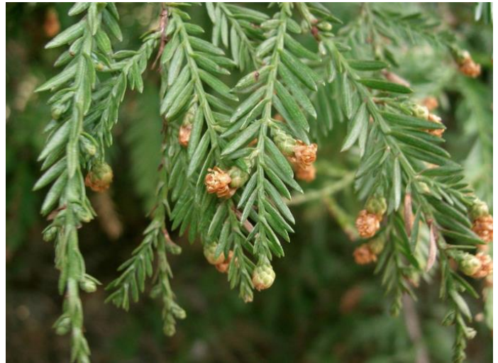
Redwood Needles & Cones