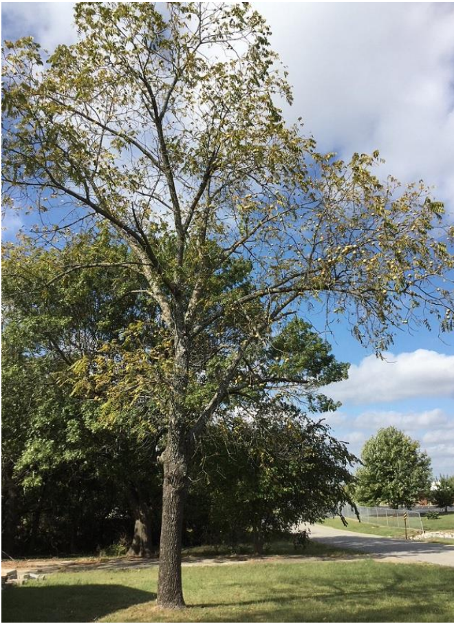
Black Walnut Tree