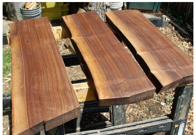
Live Edge Boards