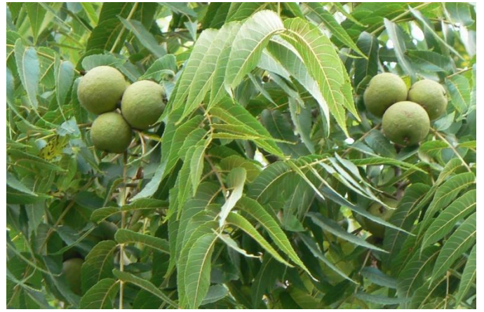
Black Walnut Leaves and Green Nuts