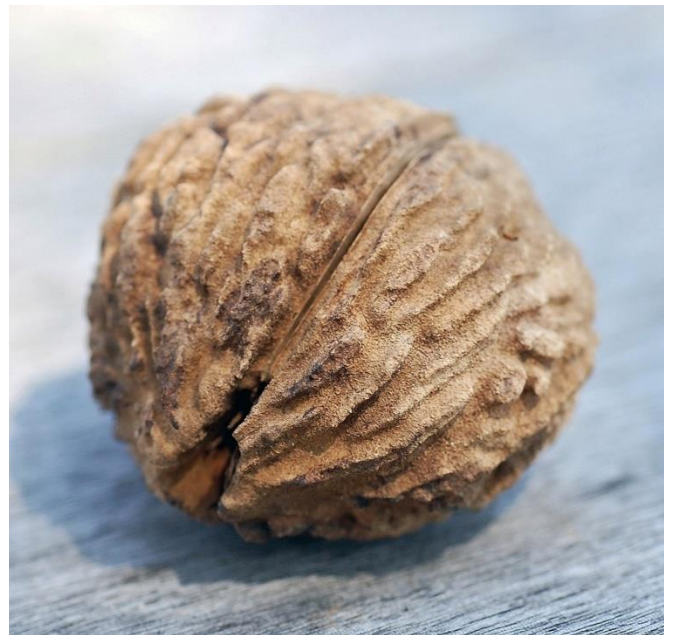
Black Walnut Nut