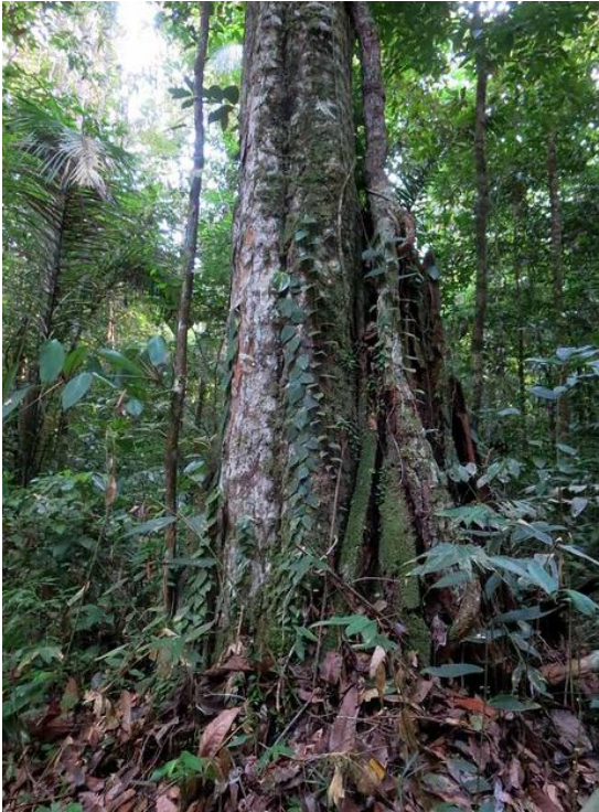
Old Growth Greenheart Tree

In this month, September 2021, we look at Greenheart ( Chlorocardium rodiei ; syn. Ocotea rodiei ). Greenheart is a medium to large size evergreen flowering tree from the Lauraceae family. Greenheart is also known as cogwood, demerara greenheart, ispingo moena, sipiri, bebeeru and bibiru.