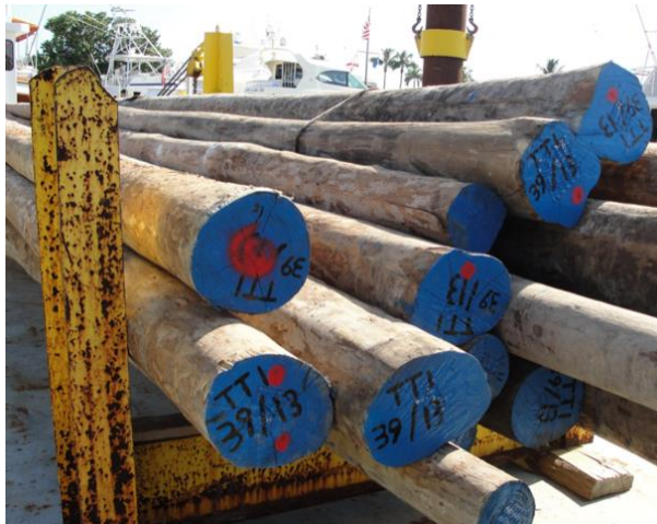
Greenheart Tree Logs