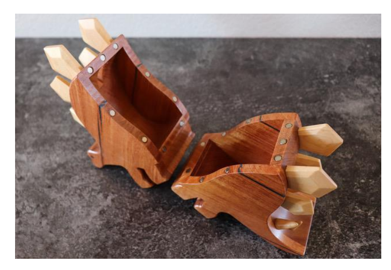
The second broken bank is entirely of Maple. I imagine it was a bear to make