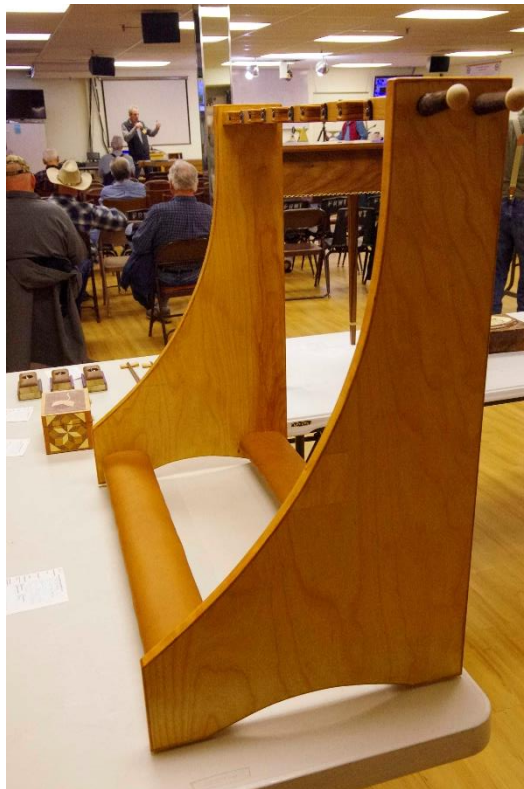
Joe Pollara, guitar rack.