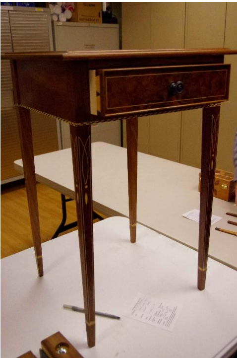
Rich Macrae, Federalist end table.