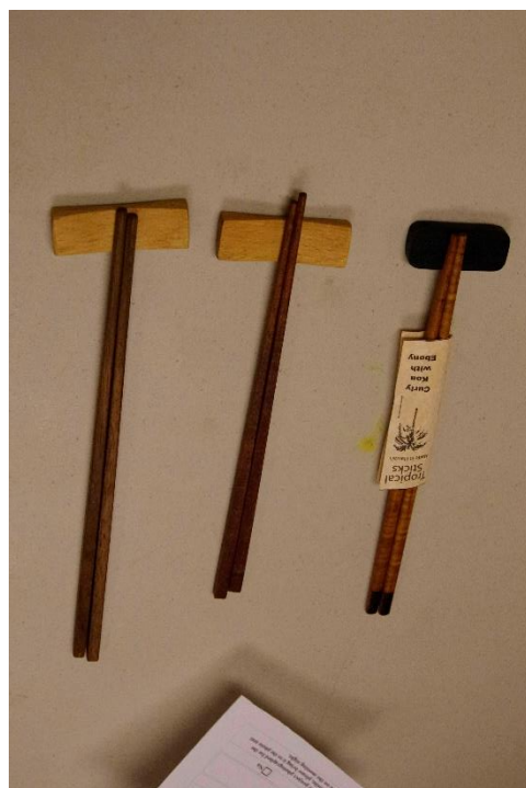
Dale Bowlin, chopsticks.