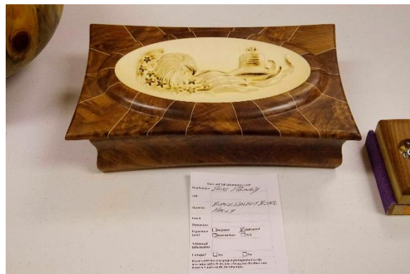
Doug Penney, walnut burl and holly box.