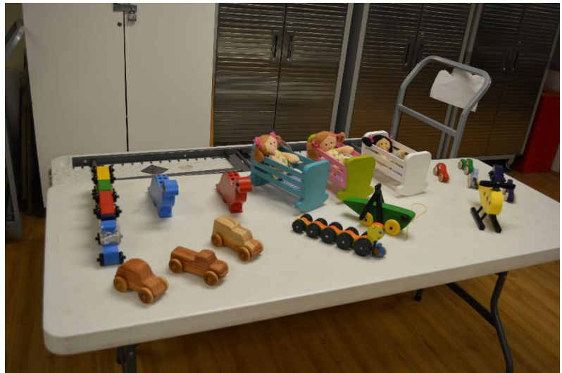
Various toys for Ed's Kids.