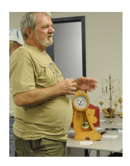
Roger Abraham Playful Clock