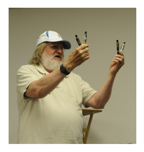
Paul Seipel Acrylic Pens