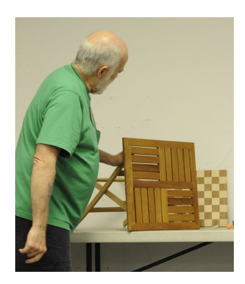
Wilbur Goltermann Chessboard & Table