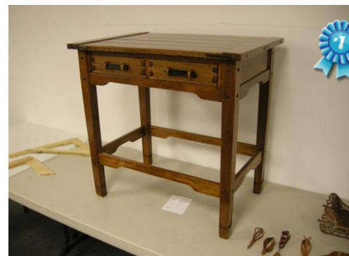
Greene & Greene Table Doug Pinney