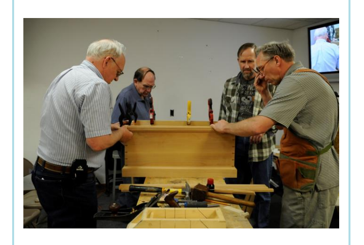
More photos are available on the website at