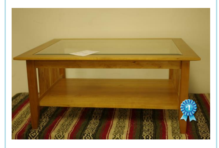
Wilbur Goltermann Mission Style Coffee Table