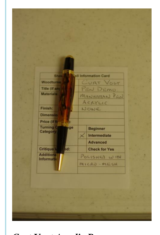
Curt Vogt Acrylic Pen