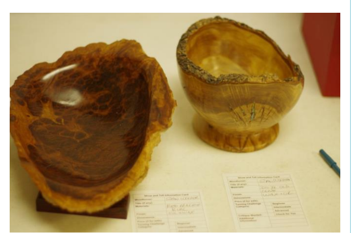
Stan Wolpert Turned Olive wood Bowls