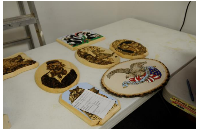
Wood burning Projects