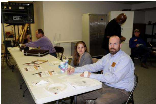
Auction record Keepers