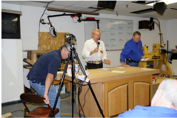
Auctioneer at work

For those of you that did not attend the October meeting, our auction was a resounding success. The guild raised $2500.00 from donations from some of our guild sponsors and from donations from our guild members. There were some fantastic buys on the donated items. We will be scheduling are next auction for late 2013. Do not miss next year's auction.