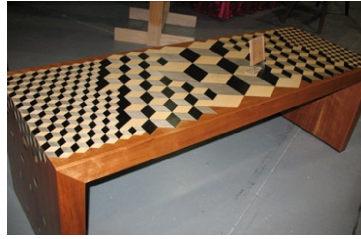
3rd Place Viki Hennon's coffee table