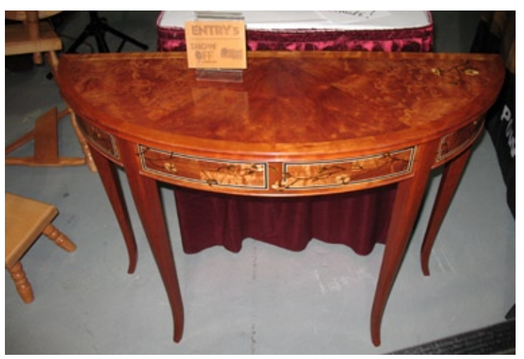
1st Place Jeff Tinker's Demilune table