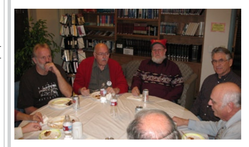
2009 CWG Holiday Party