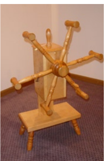
5th Place (file photo) Bill Hopper's Spinning Wheel and Weasel (Not pictured - Arnie Silverman's chair)