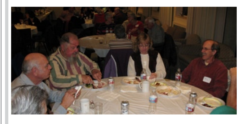
2009 CWG Holiday Party