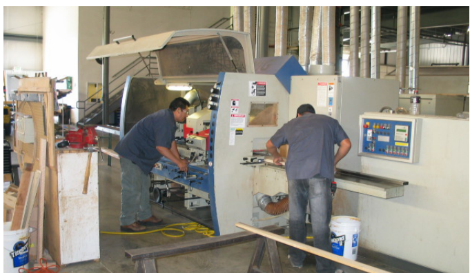
Workers operating one of the many sophisticated machines that process millwork of all shapes