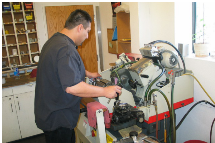
Austin makes and sharpens a majority of their cutting blades and bits