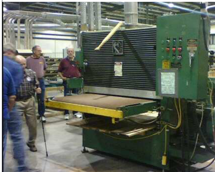
Members check out some of the impressive machinery in Austin Hardwood's shop