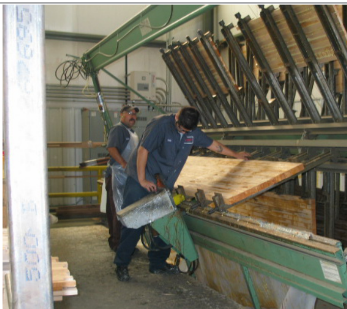
Austin workers removing a laminated board from their glue-up machine