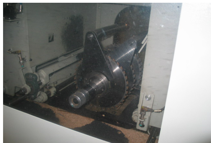
Close up shot of one of the ganged blade sets