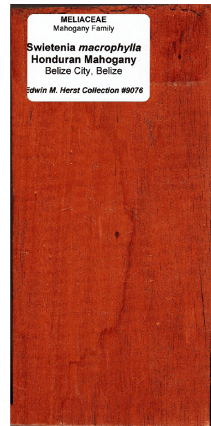
Flat sawn View