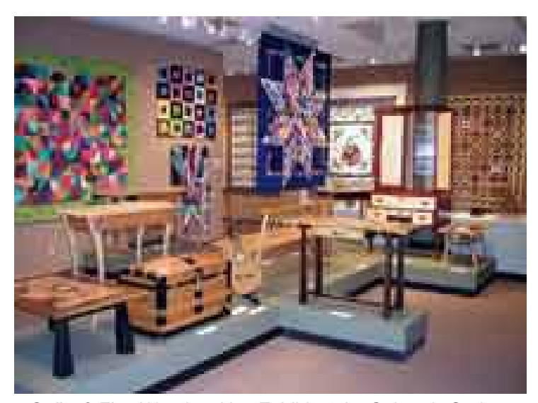
Quilts & Fine Woodworking Exhibit at the Colorado Springs Pioneer Exhibit.

I went armed with my camera but there was no photography allowed. I would have liked to have had some pictures to show. This is always a fun trip for us. This year's show was from September 3rd through October 28th and has been happening for 21 years now. The Colorado Springs Pioneer Museum is at 215 South Tejon St. The exhibition is sponsored by The Colorado Quilting Council (www.coloradoguiltcouncil.com) and The Rocky Fine woodworking Mountain Gallery. (www.rockymountainfinewoodworking.com).