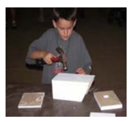
Future Guild Members assemble and paint bird houses at the recent JeffCo 4-H Fair

Shop now! These specials will end on September 30, 2005.