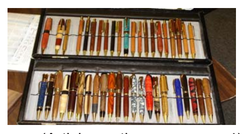
(Article continues on page 4)

After turning the blanks to the desired diameters, the next step is sanding. Chris cuts his sandpaper into small strips to conserve the paper and to make it easier to handle. With the lathe turning, he sanded in graduated grits: 150, 220, 320, 400, 600. He noted that it doesn't take a lot of pressure. He also stopped the lathe occasionally to sand in the direction of the wood grain.